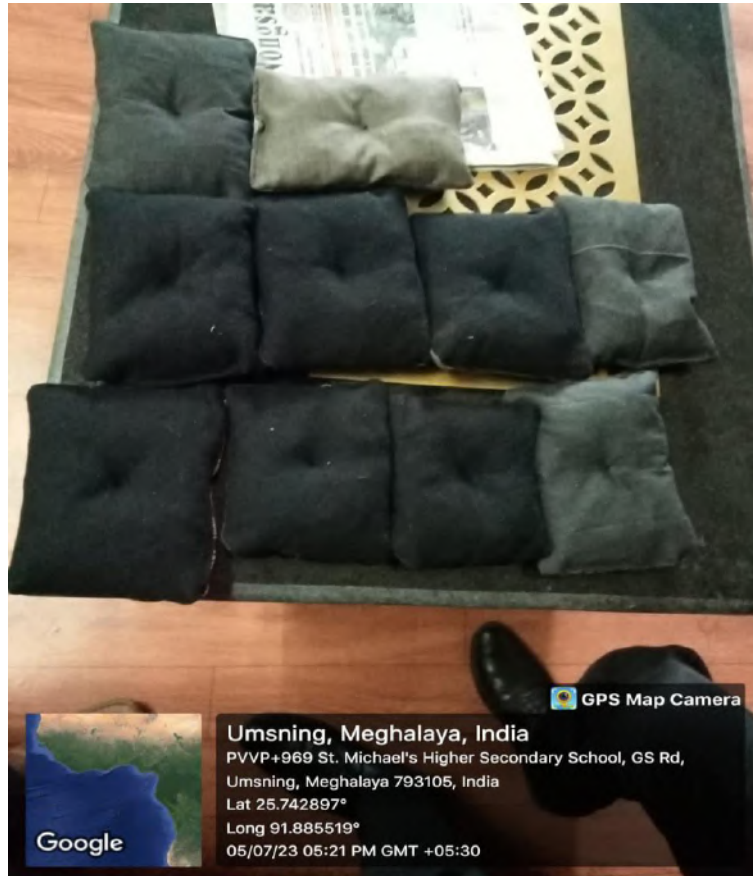
Principal Balawan college Umsning